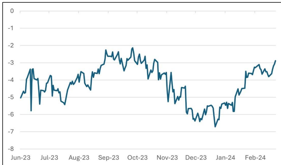
Chart 2: Market pricing of the number of rate cuts by the Federal Reserve by year-end 2024. Number of Fed rate changes anticipated by the market pricing

As the market recalibrates its expectations for interest rate cuts, we continue to advocate for a shorter duration positioning. We have previously stated our belief that a 4.0% yield on the US 10-year note is around fair value. While the current yield of 4.30% is appealing, the heightened market volatility warrants caution. We recommend that investors be selective with their entry points, aiming for yields closer to 4.50%. This approach aligns with our strategy of capitalising on market fluctuations while managing risk effectively.