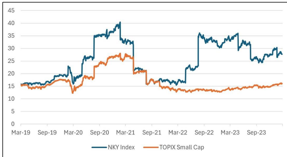
Chart 5: TOPPIX Small Cap awaiting a re-rating