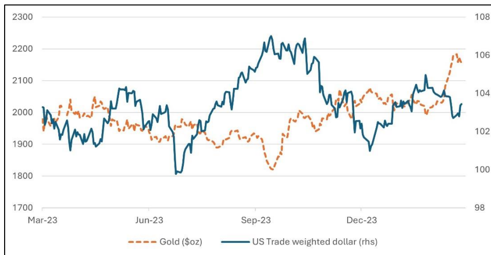
Chart 4: Gold maintains its strength despite weak dollar and assumptions of higher rates for longer

Given the market's assumption of higher-for-longer interest rates in the United States, gold has largely maintained its highs of recent months. Indeed, only when the dollar pushed higher last week did we see a small bout of profit taking in gold. We maintain our view that the strength in gold price has as much to do with the increasing market angst around the ongoing substantial rise in U.S. government indebtedness and the Fed's far-from-convincing policy making.