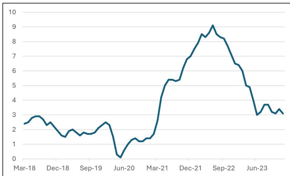
Chart 1: US CPI Due This Week; Market Expects Unchanged Headline Inflation at 3.1%

This week's US inflation report will be key for market sentiment. Macro data in recent weeks has pointed to stronger-than-expected inflation, but that strength has not been sufficient to either seriously worry the bond market or prompt the Fed to consider serious delays to a rate cut. Indeed, last week Fed Chairman Jerome Powell appeared to want to dispel any notion that a rate cut would not be forthcoming. Maybe Powell was taking on those in the market who rule out any rate cut this year or some such as Larry Summers who, in fact, talk up the risk of a possible rate rise.