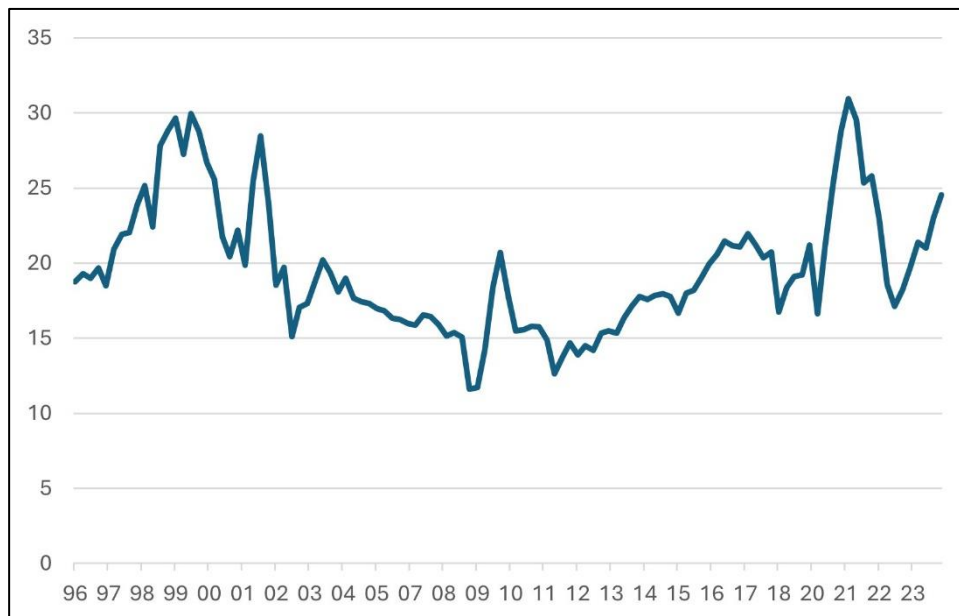
Chart 2: S&P500 Current P/E Multiple

The US equity market trades at a P/E multiple of 24.5x historical earnings, with only exceptions being COVID times when earnings collapsed and the tech bubble of 2000 when the market peaked at a P/E of 30x.