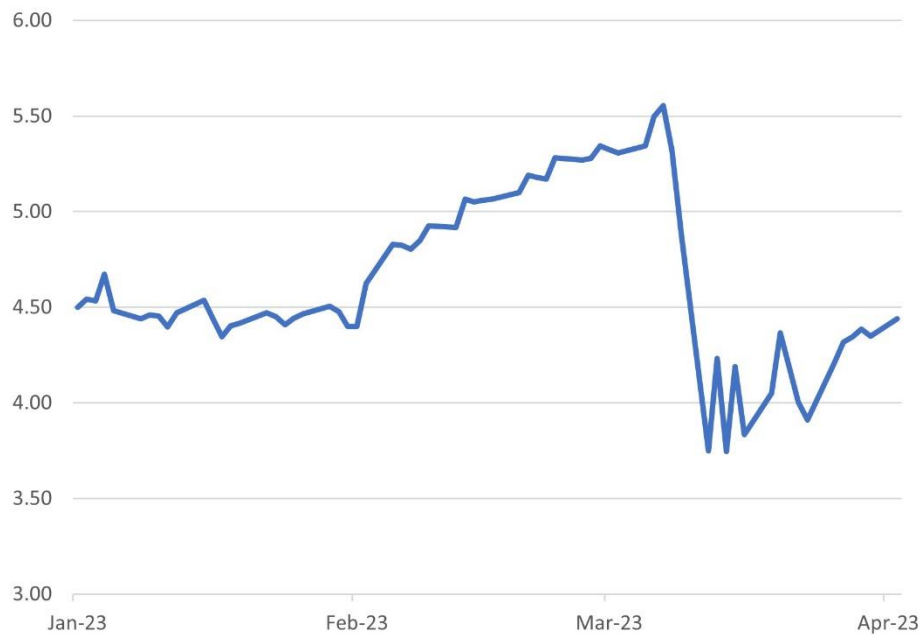
Chart 3: Market expectations for the level of Fed funds rate as of December 2023

US government bond yields also moved lower on anticipation that the Federal Reserve would cut interest rates before the year's end. The US money markets now price that the US Fed funds rate will be around 4.25-4.50% level at the December meeting, compared with the implied interest rate of 5.5% in early March.