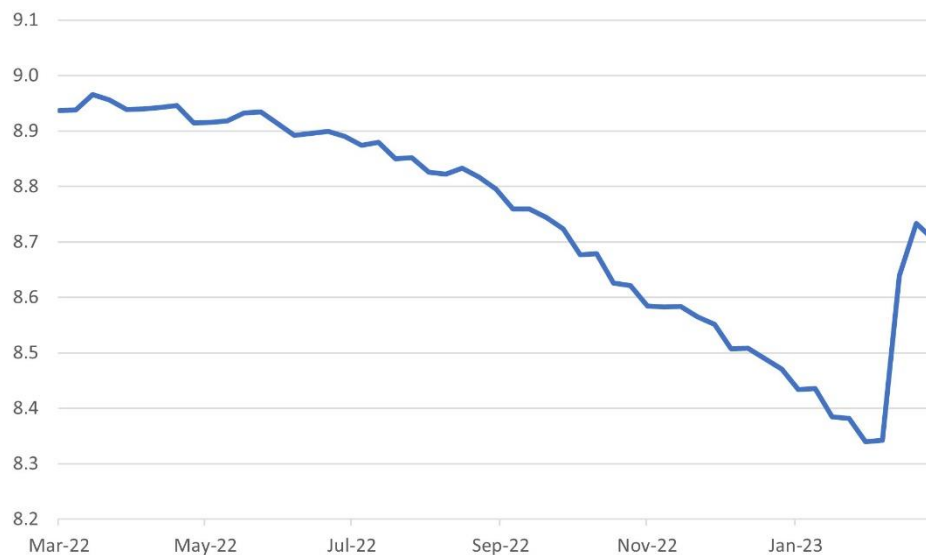
Chart 2: Size of the Federal Reserve balance sheet ($ Trillion)

The banking crisis that unfolded during the quarter led to a substantial intervention by the Fed in the form of quantitative easing. In essence, the Fed pumped billions of dollars into the system, reversing almost 60% of the previous quantitative tightening seen since May 2022. Quantitative tightening, whereby the Fed sells bonds in the market, was one of the factors that had previously pushed yields higher.